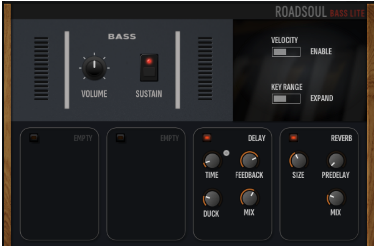
Figure 2: User Interface